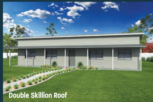
Double Skillion Roof