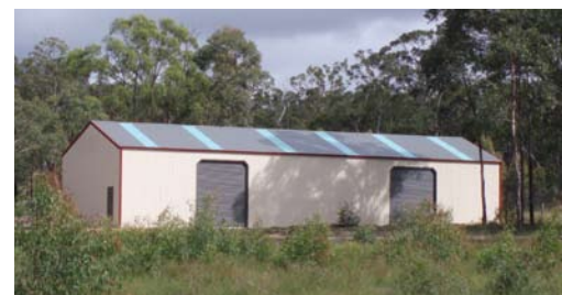
Enclosed Farm Processing Shed