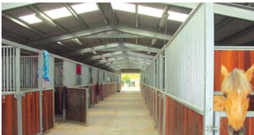
Farm Shed with Stable Modules installed