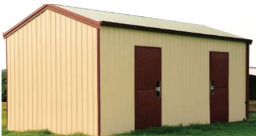
Horse Stables with custom Stable Doors