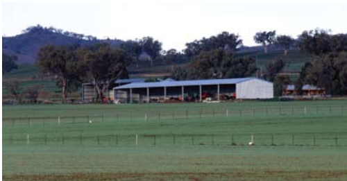
Large Open Machinery Shed