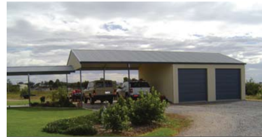
Two Bay Farm Building with Garaport

All CSB structural components are supplied through BlueScope Lysaght to ensure quality and strength are not compromised.