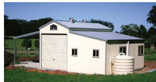
American Barn with Open Lean-to