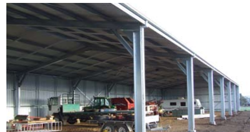
Internal View of large Machinery Shed