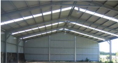
Rural Horse Dressage Arena

CSB understand that most customers prefer a very personalised service, therefore CSB are committed to ensuring that customers are completely satisfied with their purchase from start to finish.