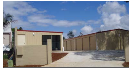
Commercial Storage Unit Solutions