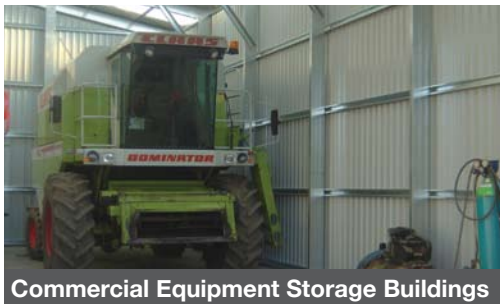
Commercial Equipment Storage Buildings