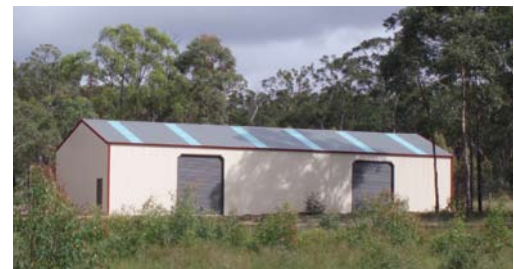
Light Industrial Building Solutions