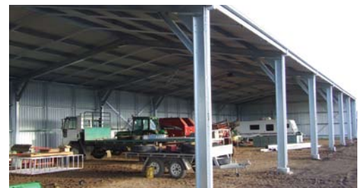
Commercial Open Front Cover Options