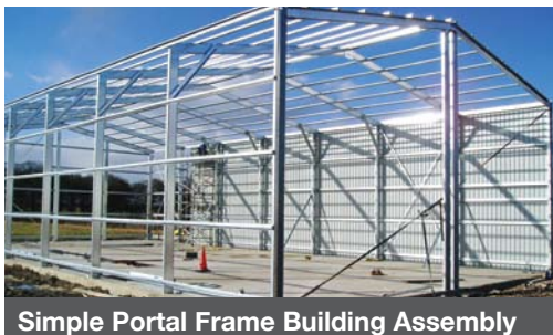
Simple Portal Frame Building Assembly