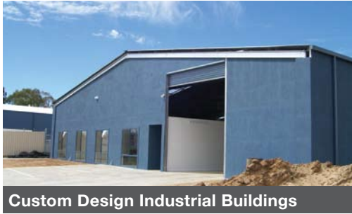
Custom Design Industrial Buildings

CSB understand that most customers prefer a very personalised service, therefore CSB are committed to ensuring that customers are completely satisfied with their purchase from start to finish.