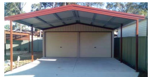
Double Garage with Garaport