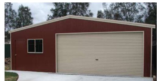
Custom Garage with extra wide Roller Door