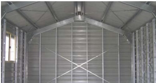
Single Garage with Stud Wall Frame