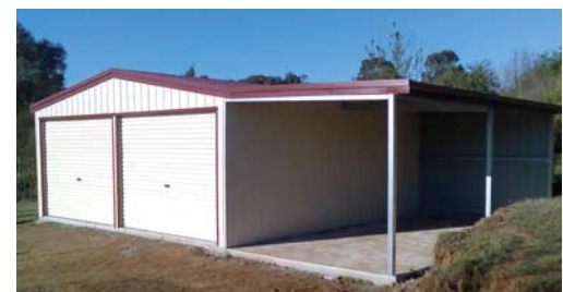
Double Garage with Lean-to