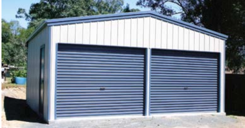
Double Garage with Gable Roller Doors

CSB understand that most customers prefer a very personalised service, therefore CSB are committed to ensuring that customers are completely satisfied with their purchase from start to finish.