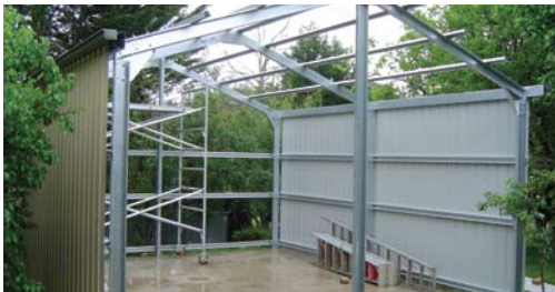
Portal Frame Garage Framework