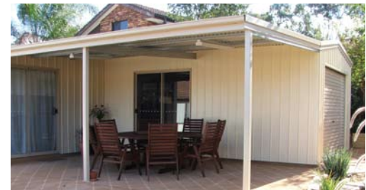
Single Garage with Lean-to