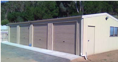
Four Car Garage with Side Wall Roller Doors