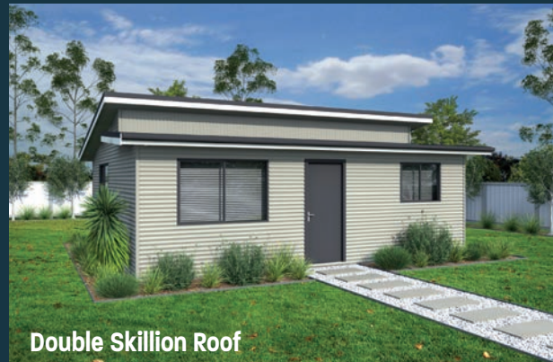
Double Skillion Roof